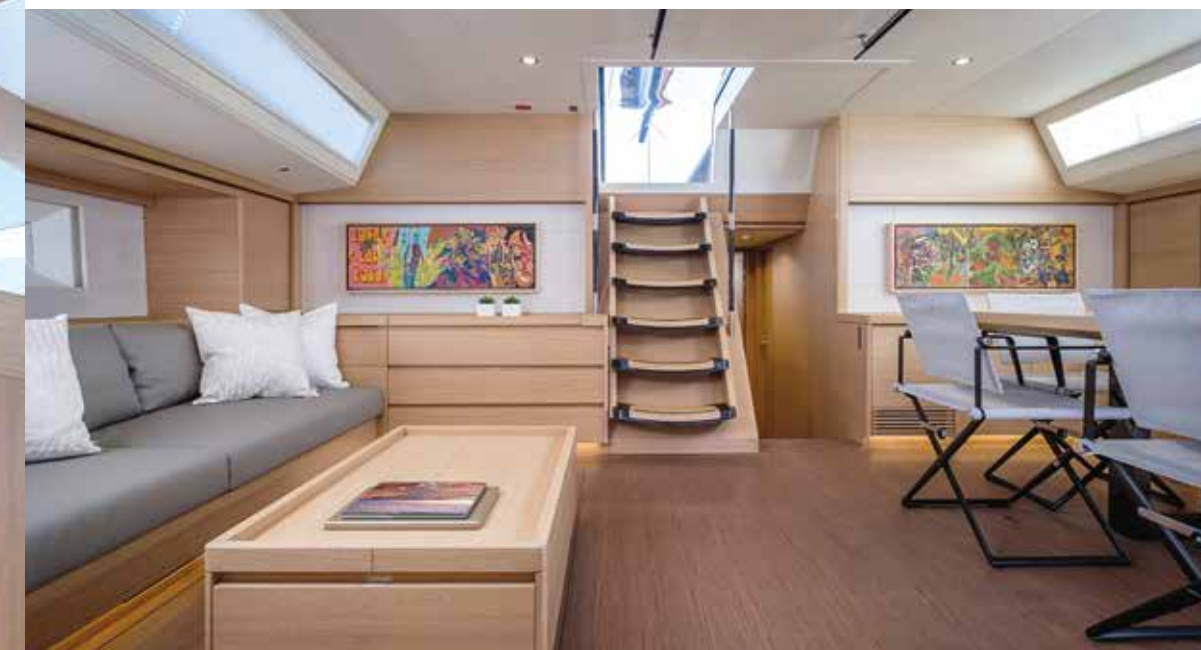
Viewed from the outside, Sorceress's aggressive lines seem to say "let's move", but below deck the atmosphere is more "sit down and stay a while". In the saloon (above and left) neutral colours and natural light are accented by a series of vibrant paintings by South African artist Khaya Witbooi