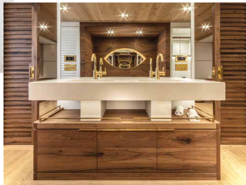
Above and right: the owner's suite features a spa-like en suite closed off by sliding louvre doors on either side of the dual vanity. Below: the Nauta Air design by Mario Pedol and Massimo Gino of Nauta Yachts for Cantiere delle Marche is an elegant rendition of the robust, go-anywhere explorer

“We are quite earthy people and not interested in an interior full of shiny, polished surfaces... I wanted to use natural materials like reclaimed wood and hemp, linen and bamboo”