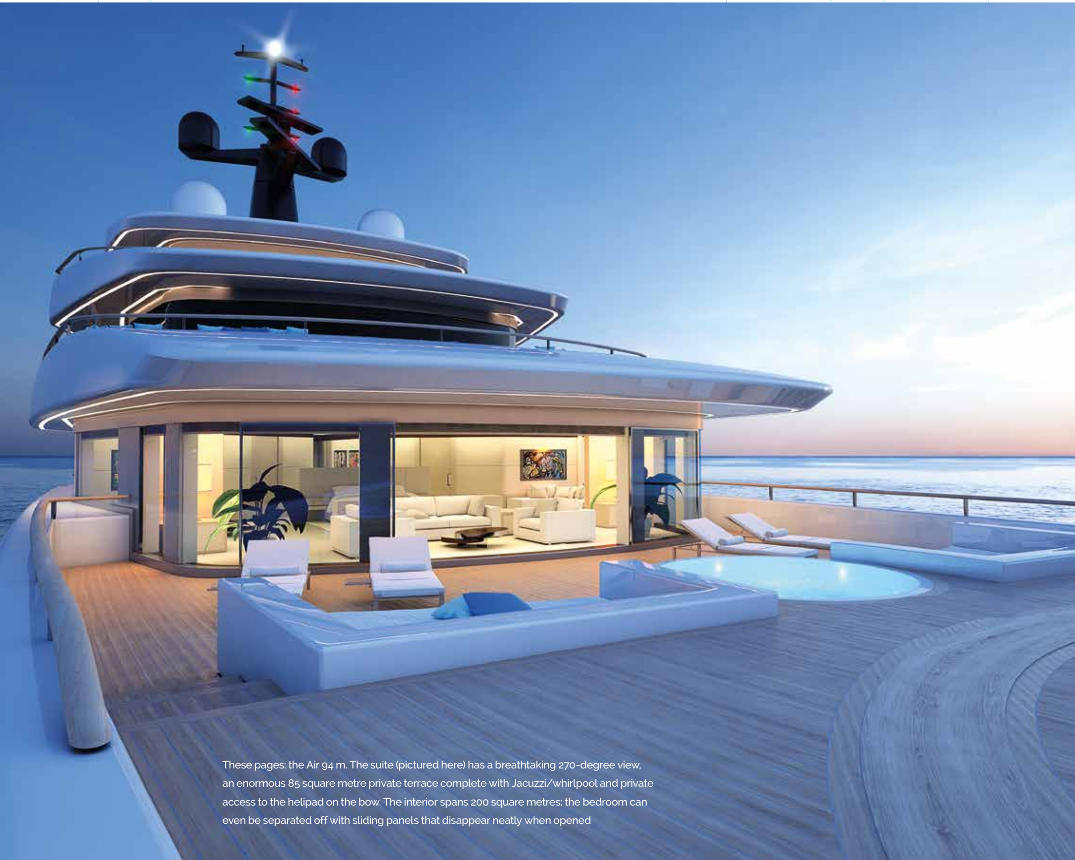
These pages: the Air 94 m. The suite (pictured here) has a breathtaking 270-degree view, an enormous 85 square metre private terrace complete with Jacuzzi/whirlpool and private access to the helipad on the bow. The interior spans 200 square metres; the bedroom can even be separated off with sliding panels that disappear neatly when opened